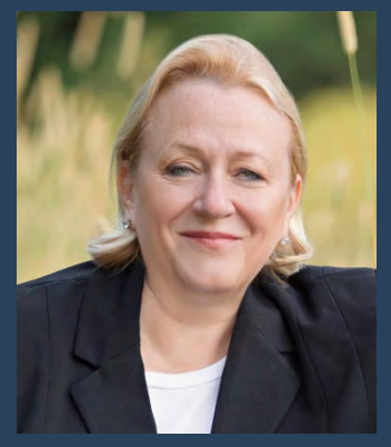
Catherine AUSTIN FITTS