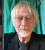
Wolfgang WODARG MD